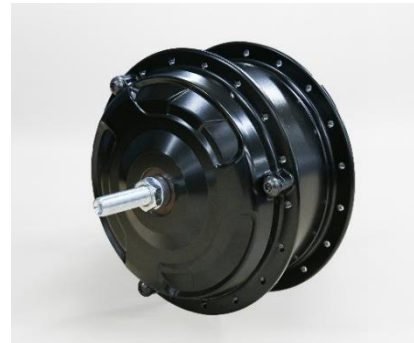
Nidec's motor for regenerative system-based battery-assisted bicycles

FEREMO<sup>TM</sup>, the regenerative power-assisted system that Taiyo Yuden developed, uses its power-assisting motor as a generator when the person on a bicycle puts on the brake or has his/her feet off the pedals, to collect and reuse motion energy. This feature enables FEREMO<sup>TM</sup> to enjoy a significantly longer per-charge running distance , or up to 1,000km , than conventional power-assisting systems. In addition, with speed suppressed while the regenerative system is on, one can ride a bicycle safely even on a downhill.