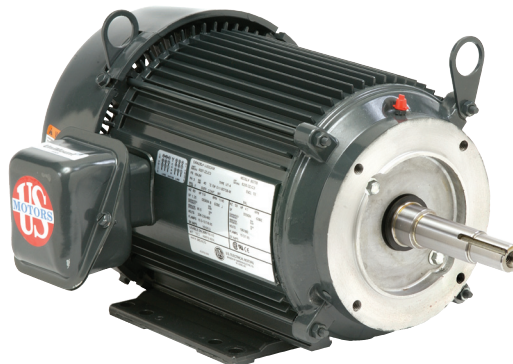
UNIMOUNT 125® Motor