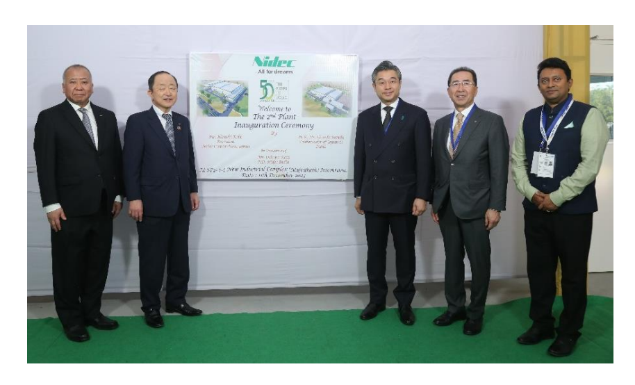
Attendees pose for a photo at the new building's opening ceremony

Nidec Corporation (TSE: 6594; OTC US: NJDCY) (the "Company") today announced that Nidec India Private Limited ("Nidec India"), a wholly owned subsidiary of the Company, has held an opening ceremony of the new, second building of its existing factory in Neemrana, Rajasthan, in the Republic of India ("India").