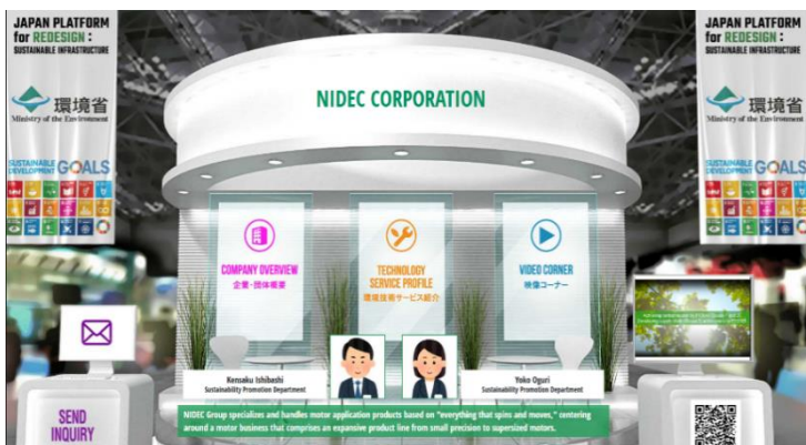
Nidec Booth in the virtual exhibition of the Japan