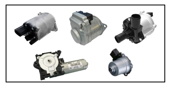
Motor-related products for automobiles

The three companies' agreements regarding the JV as of now are as follows;