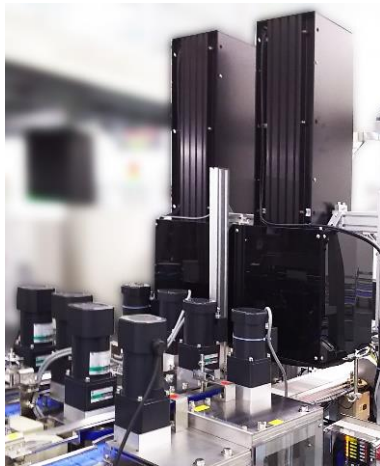
Nidec Tosok's Actual-bottle visual inspection equipment

Nidec Tosok Corporation (“Nidec Tosok”) announced today that it has launched space-saving visual inspection equipment for beverage production lines.