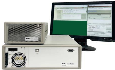
AC/DC Capacitance tester

Nidec Advance Technology Corporation (“Nidec Advance Technology”) announced today that it will exhibit its products at PCIM Expo & Conference 2025, an event to be held in the city of Nürnberg, Germany from Tuesday, May 06 – Thursday, May 08, 2025.