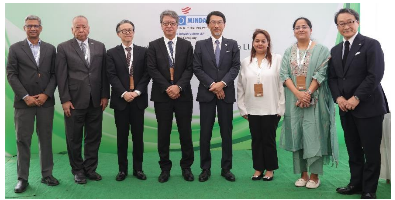
People attend the groundbreaking ceremony of Nidec India's new factory building.

Time & date: 10:30 – 12:00 on Monday, May 19, 2025 local time