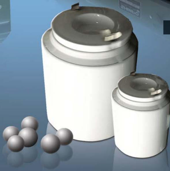
Porcelain Jars - Internal Capacity