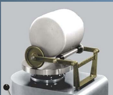
Ball Mill Wheel Attachment Fits on the VL-Whisper or RK-Whisper with a 12" wheel-head