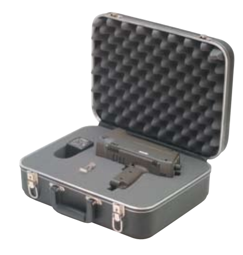
DT-725KIT Includes Protective Carrying case, spare flash tube and Battery Charger