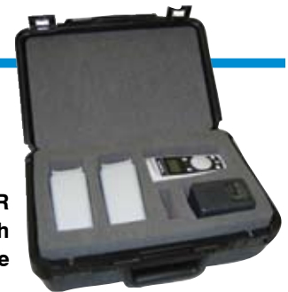
Optional DT-900-PR Professional Kit with Included Case