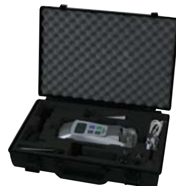
FGV-HXY with Accessories in Protective Carrying Case