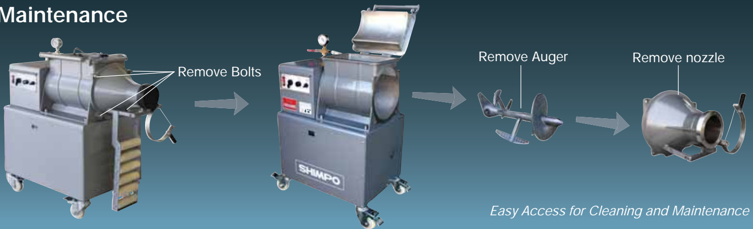
Easy Access for Cleaning and Maintenance