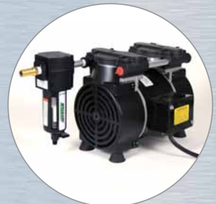
Vacuum pump option (ACC-AV-071)